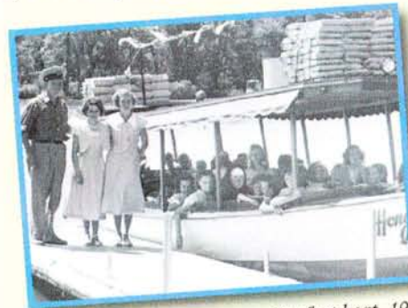
Our first boat, 1945

Parking is available at Pottawatomie Park. There is no charge for parking during your cruise provided you arrive shortly before departure.