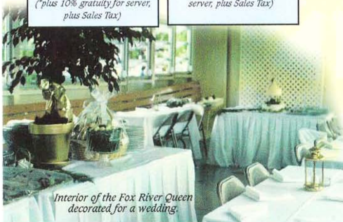
Interior of the Fox River Queen decorated for a wedding.

Call early to reserve your event! 1.630.584.2334